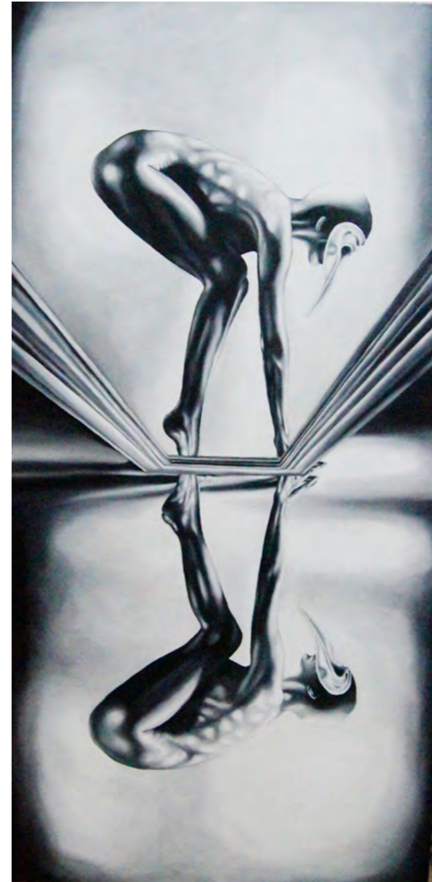
BILATERAL OIL ON CANVAS 284.48 x 60.96 cm