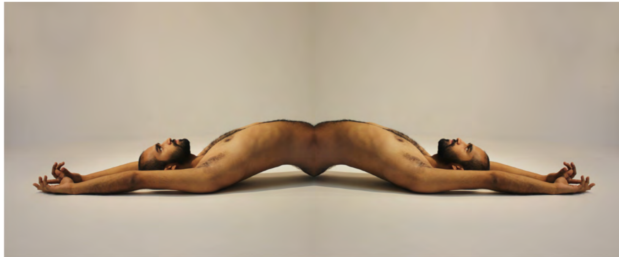
OBLIVION I C-TYPE DIGITAL PRINT ON ARCHIVAL PAPER 35.56 x 17.78 cm

2013: Viscous Rivers , Color Gallery, Lahore