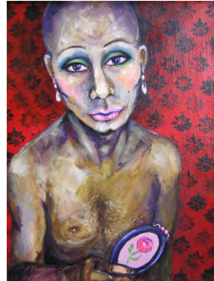
THERE WAS ONCE A BOY (DIPTYCH) ACRYLICS ON LINEN 27 x 35 cm each

2015: Nishanna , Canvas Art Gallery, Karachi 2015: Silsila , Sanat Initiative Gallery, Karachi 2015: About Her , Color Gallery, Lahore, Pakistan. 2013: My name is Khan , Indus Valley School Gallery, Karachi 2012: Usman aur Mein , Koel Art Gallery, Karachi 2012: Unbruised , The Drawing Room Art Gallery, Lahore 2012: The Noose , Canvas Gallery, Karachi 2011: Imperfection , Rohtas Gallery, Islamabad 2011: Looking through the Wider Lens , Jankonssen Gallery, Basel, Switzerland 2011: I see you , Nomad Art Gallery, Islamabad 2011 Expo Atelier Cognée , Gallery Gauch, The École Nationale Supérieure des Beaux-Arts, Paris, France 2010: Lakh war Sadkay , Alhamra Art Gallery, Lahore. 2010: Mazaar Bazaar , Zahoor ul Akhlaq Gallery, National College of Arts, Lahore 2009 Caramel Orchard , Nairang Gallery, Lahore 2009: Stepping out 2 , Rohtas Gallery, Islamabad 2008: Democracy , Zahoor ul Akhlaq Gallery, National College of Arts, Lahore