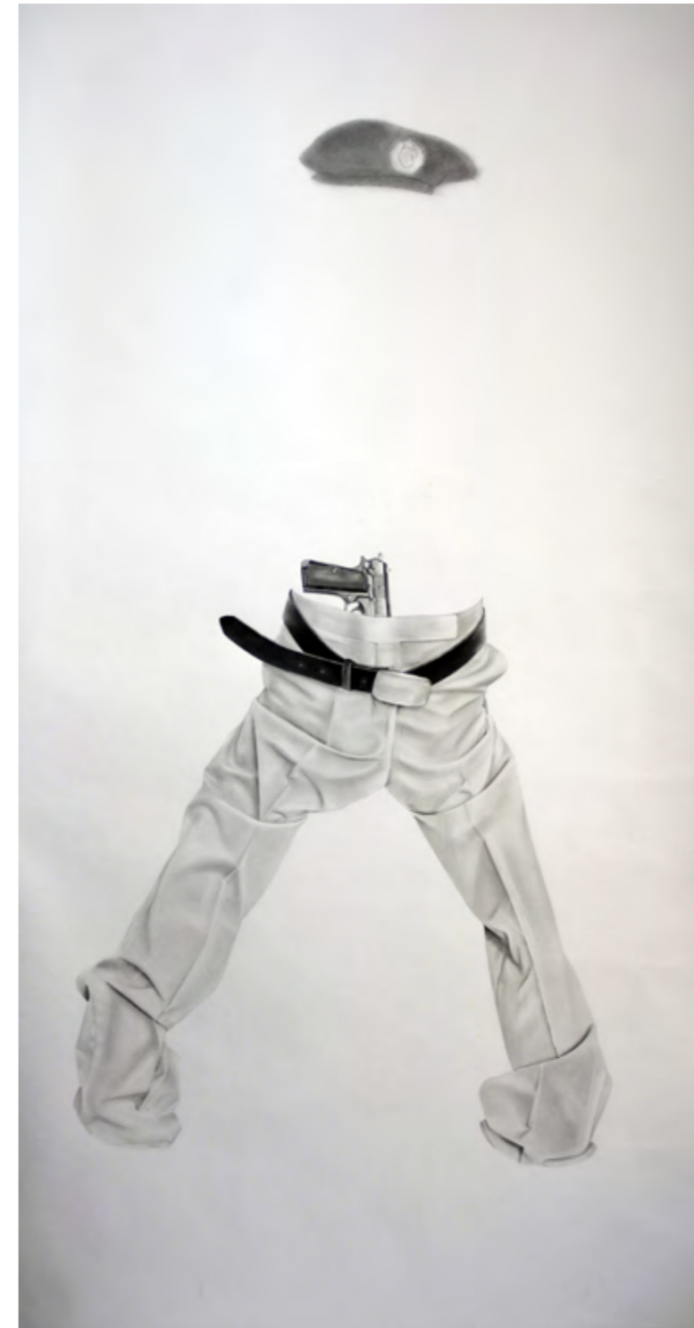
UNTITLED GRAPHITE & CHARCOAL ON PAPER 203.2 x 101.6 cm