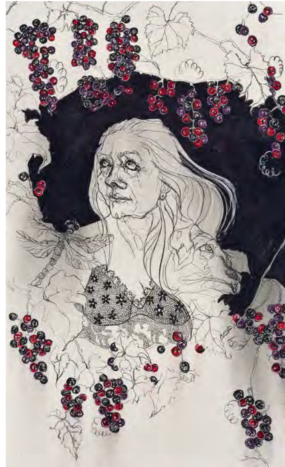
THE STRANGE FRUIT CHARCOAL & PASTELS ON CANVAS 152.4 x 91.44 cm