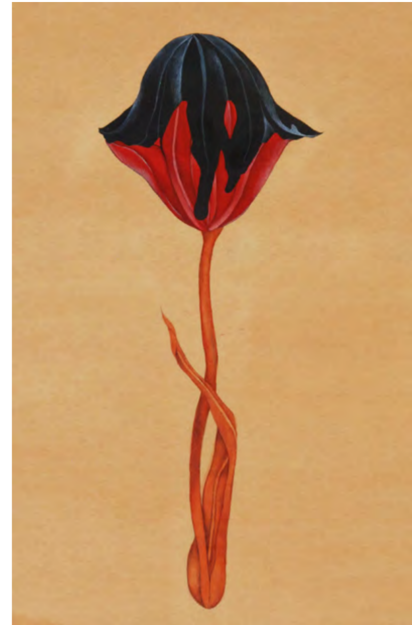
CONSUMED GOUACHE ON WASLI 96.52 x 154.94 cm