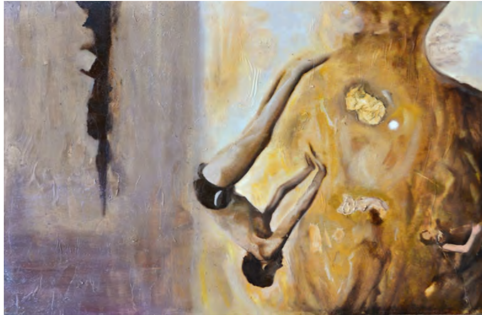
LAKE HOUSE 02:55 PM OIL ON CANVAS 35.56 x 17.78 cm

2015: Hum Jo Tareek Rabon Mein Marey Gaey... , Awami Art Collective, Karachi 2015: About Her , Color Gallery, Lahore 2014: Anomalous , Sanat Initiative, Karachi 2014: Fresh , Amin Gulgee Gallery, Karachi 2014: But the most beautiful thing about my burrow is its stillness... , Taseer Art Gallery, Lahore 2013: The Space in Between , Taseer Art Gallery, Lahore 2013: In Conversation with Migration Series , The Phillips Collection, Washington DC 2013: Analogical Paradigms , Indus Valley School Gallery, Karachi 2013: Limbs: Anatomy of Images , Attic Studio, Alhamra Art Center, Lahore