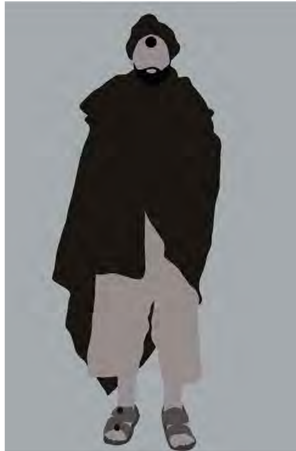
HIM DIGITAL PRINT ON CANVAS 101.6 x 132.08 cm