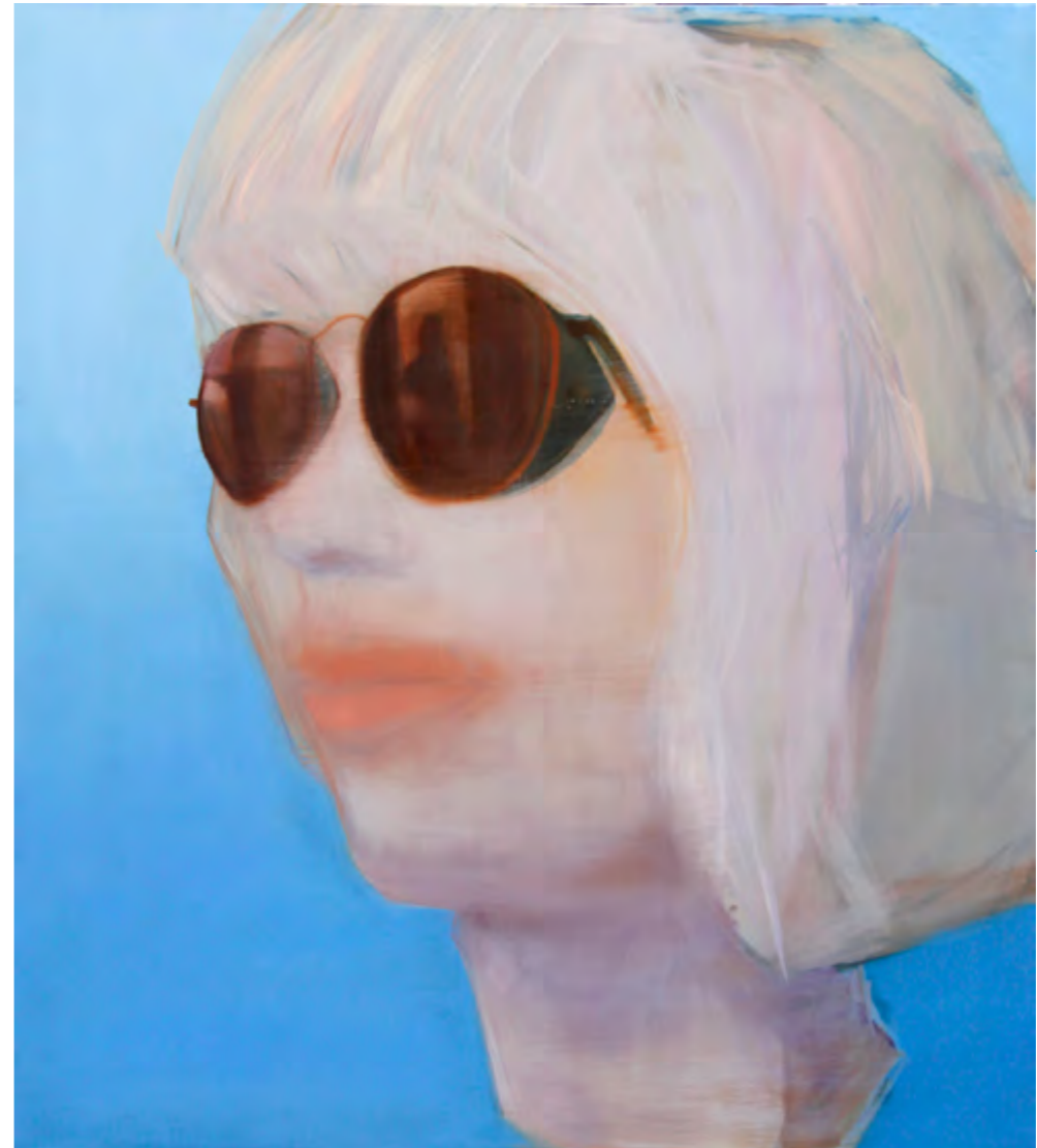
THE VIRTUAL SHRINK OILS ON CANVAS 111.76 x 152.4 cm