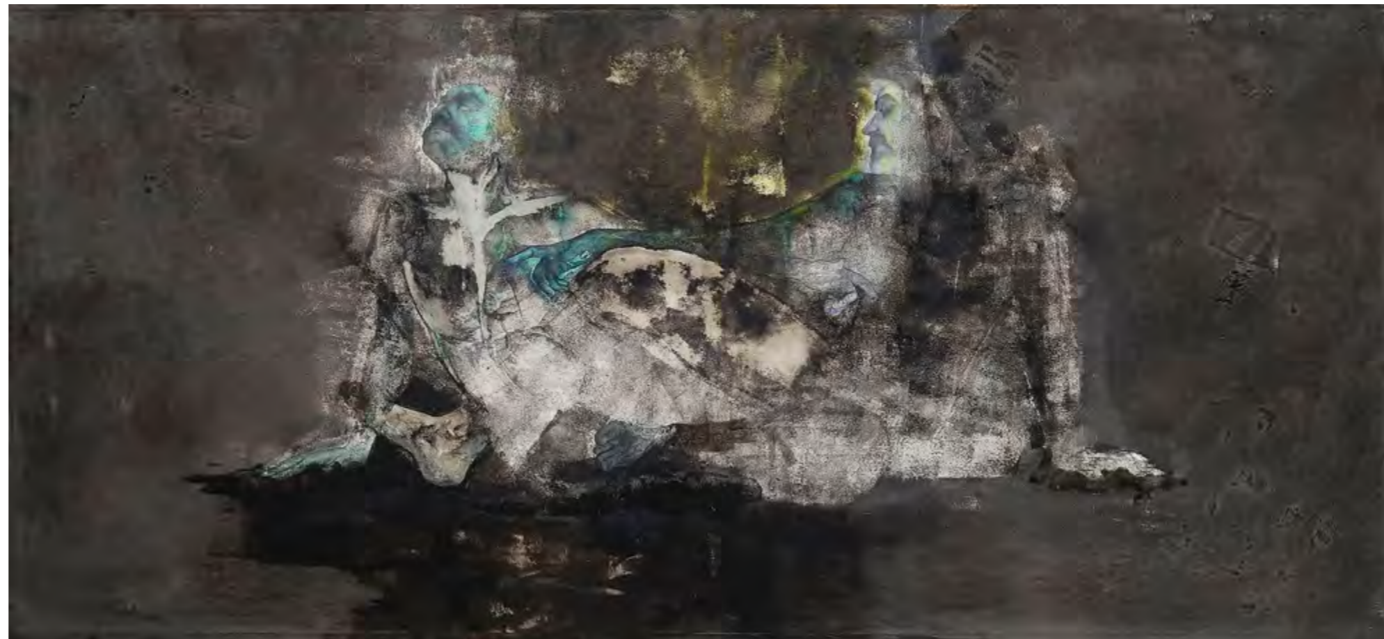
THE KINGDOM OF GOD IS WITHIN YOU MIXED MEDIA ON WASLI 35.56 x 17.78 cm

2014: Massacre of the Innocents , National Art Gallery, Islamabad 2013: In Transit Chashama , New York City, USA 2012: Pakistan NOW! Resurgence and Subversion in Art , Fourth Eye Gallery, Toronto, Canada 2010: Vision of Pakistan , Shakir Ali Museum, Lahore 2010: Miniatures , Nairang Art Gallery, Lahore 2010: Celebrating Creative Intellect , National Art Gallery, Islamabad 2009: Amalgamation , Shakir Ali Museum, Lahore 2007: The Art of Story Telling , New End Gallery, London, England